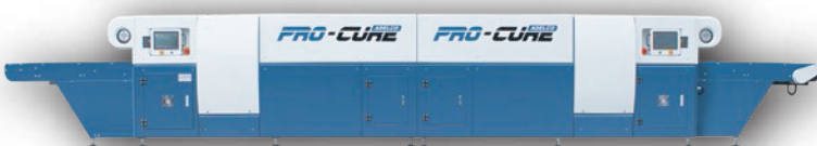
6 meter model