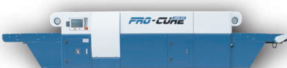
4 meter model