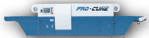
3 meter model